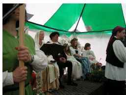
A 12th Century German Court Re-enactment

(See Project Contest Rules for all other regulations)