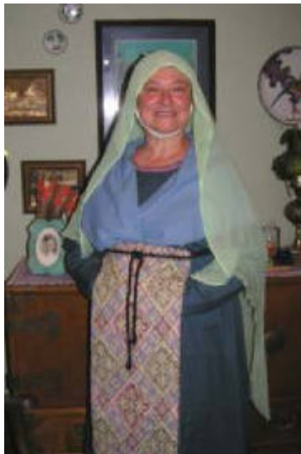
A 12th Century German Woman of the burgher class